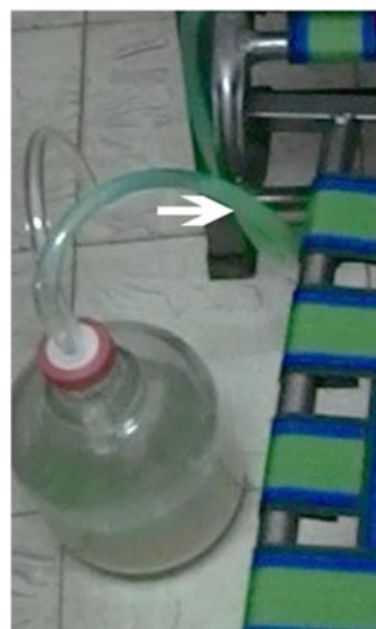
Figure 2. The drainage system shows the fluid in the chest tube presenting a bluish discoloration (white arrow).

In patients with chest tube inserted, diagnosis of esophageal perforation into pleural space should be considered with the following characteristics: a concordance of drainage output according to meal, a bluish discoloration of chest tube after drinking methylene blue, and biliary and food contents within chest tube. The fluid in the chest tube presenting a bluish