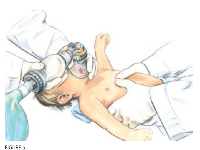
Two thumb-encircling hands chest compression in infant (2 rescuers).

Two-finger chest compression technique in infant (1 rescuer).